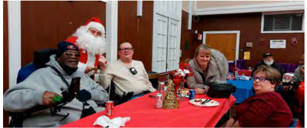
UroPartners Employees volunteering at the Christmas Luncheon