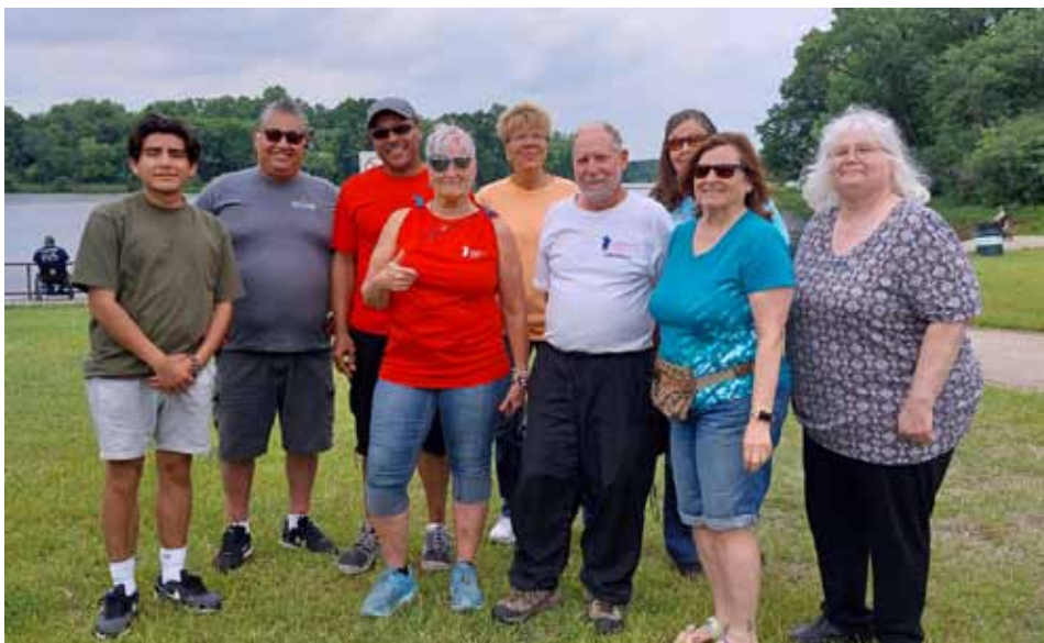
Many Thanks to the Volunteers at the Fishing Derby at Busse Woods

11, 2022, was a relaxing day for all of us who attended on a beautiful 70's-degree cloudy day. We all enjoyed the fishing, the day, the food, and most importantly, the companionship. Happy to see new members were attending as well as new volunteers