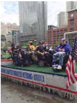
The VPVA float at the Chicago Memorial Day Parade.