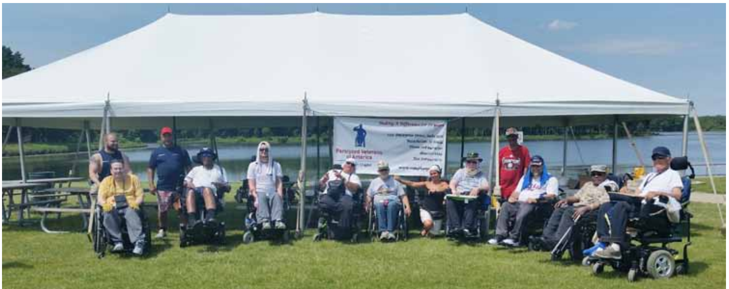
Residential Care Facility PVA members at BUSSE WOODS fishing derby on June 11, 2016.