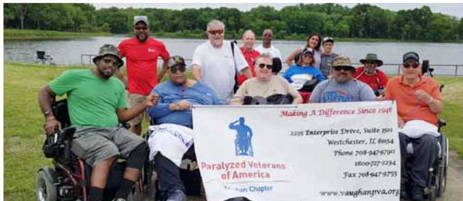
Vaughan PVA Members at Busse Woods one day fishing derby.