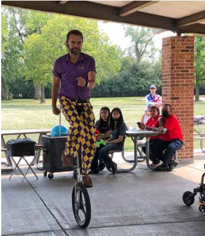
Circus Boy entertained us all at the Summer Picnic.

Vaughan Chapter wishes you all a Happy, Healthy Holiday Season and a New Year filled with Peace and Happiness.