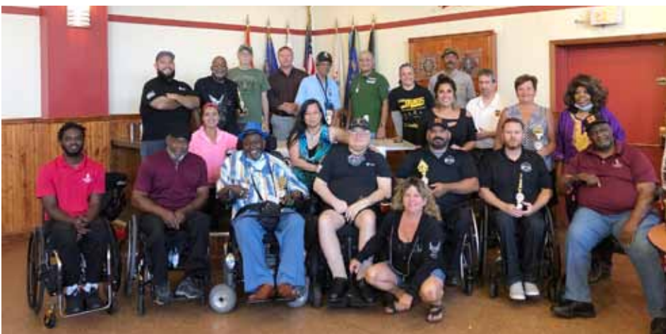
Participants and volunteers at our 2-day a veteran chess event.

Paralyzed Veterans of America PVA National Vice President Vaughan Chapter President