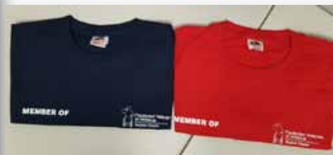
Vaughan Chapter Hat & T-shirt