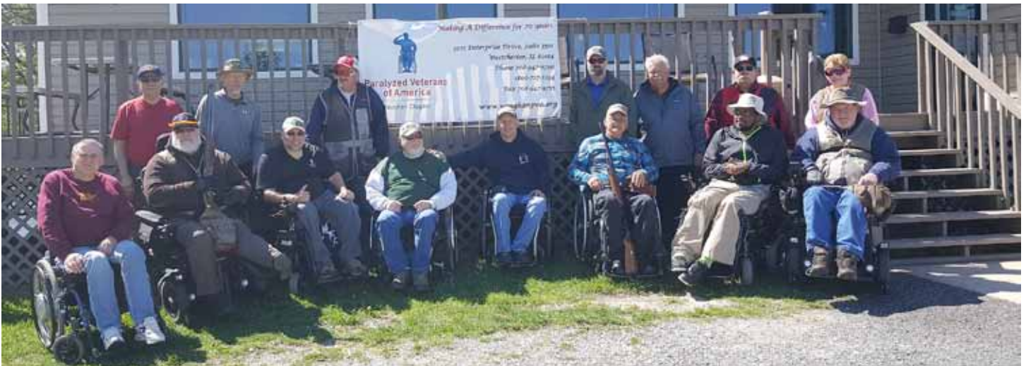
At the Vaughan PVA Trap Shoot Tournament on April 22, 2017 in Edwardsville, IL